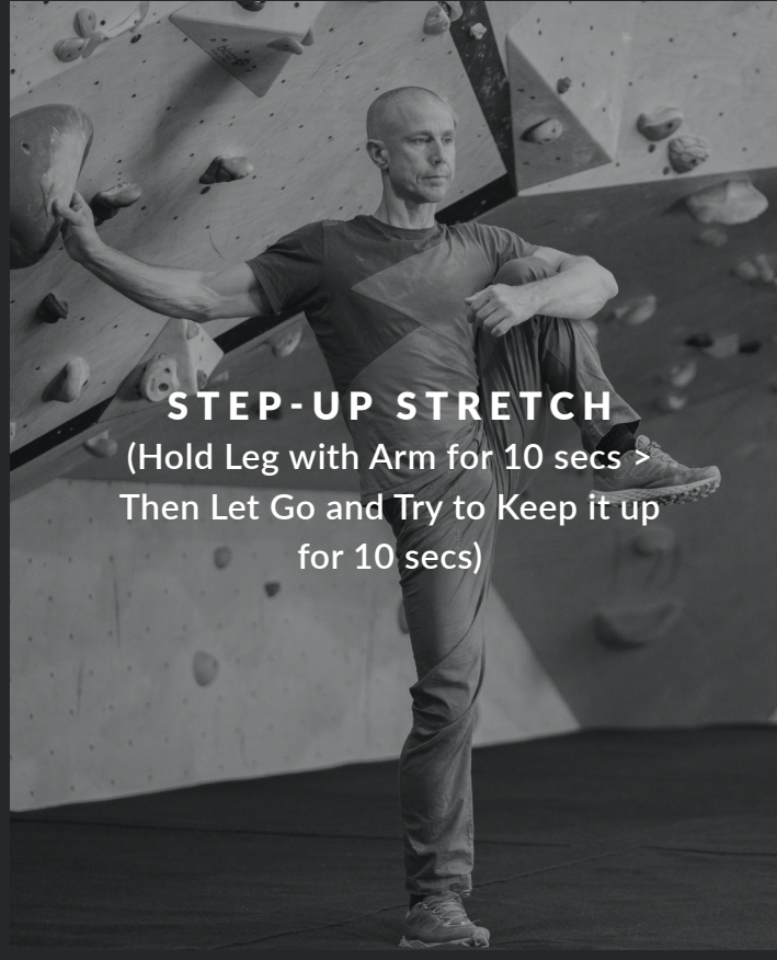
STEP-UP STRETCH (Hold Leg with Arm for 10 secs > Then Let Go and Try to Keep it up for 10 secs)