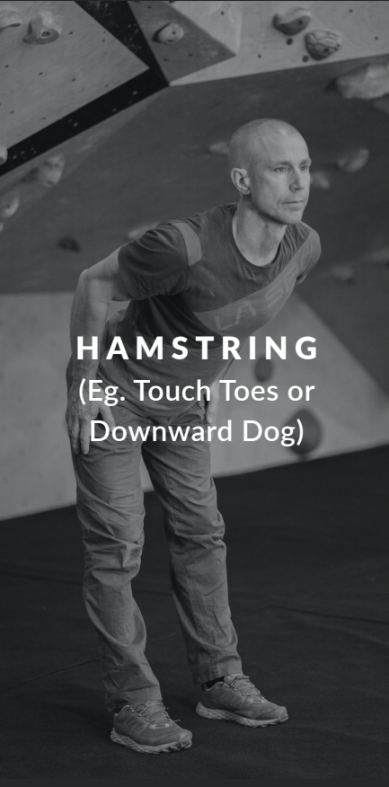
HAMSTRING (Eg. Touch Toes or Downward Dog)