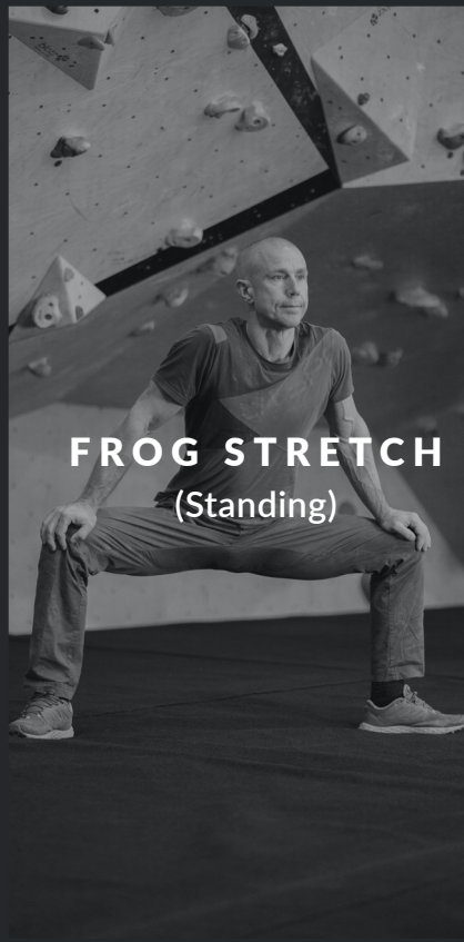
FROG STRETCH (Standing)